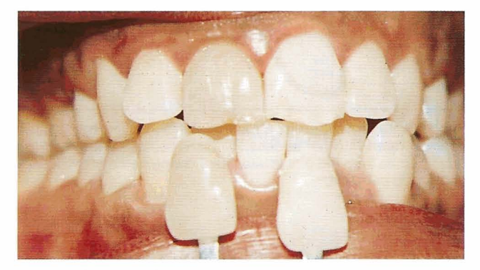
Fig 2a Central incisor discolored from trauma, shown after endodontic therapy has been completed.