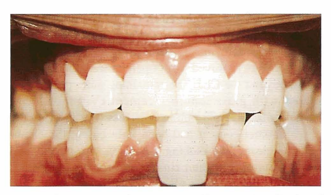
Fig 2b Color change after treatment with external application of 10% carbamide peroxide in a custom tray to all the teeth and an internal application to the open chamber of the nonvital tooth.

non–eugenol-containing temporary cement (Fermit, Ivoclar). The non–eugenol-containing material was used to avoid future contamination of the acid-etched resin composite restoration, which was to be used to close the orifice to the canal.